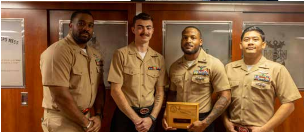
CVN 70 SAILOR OF THE QUARTER DINNER.