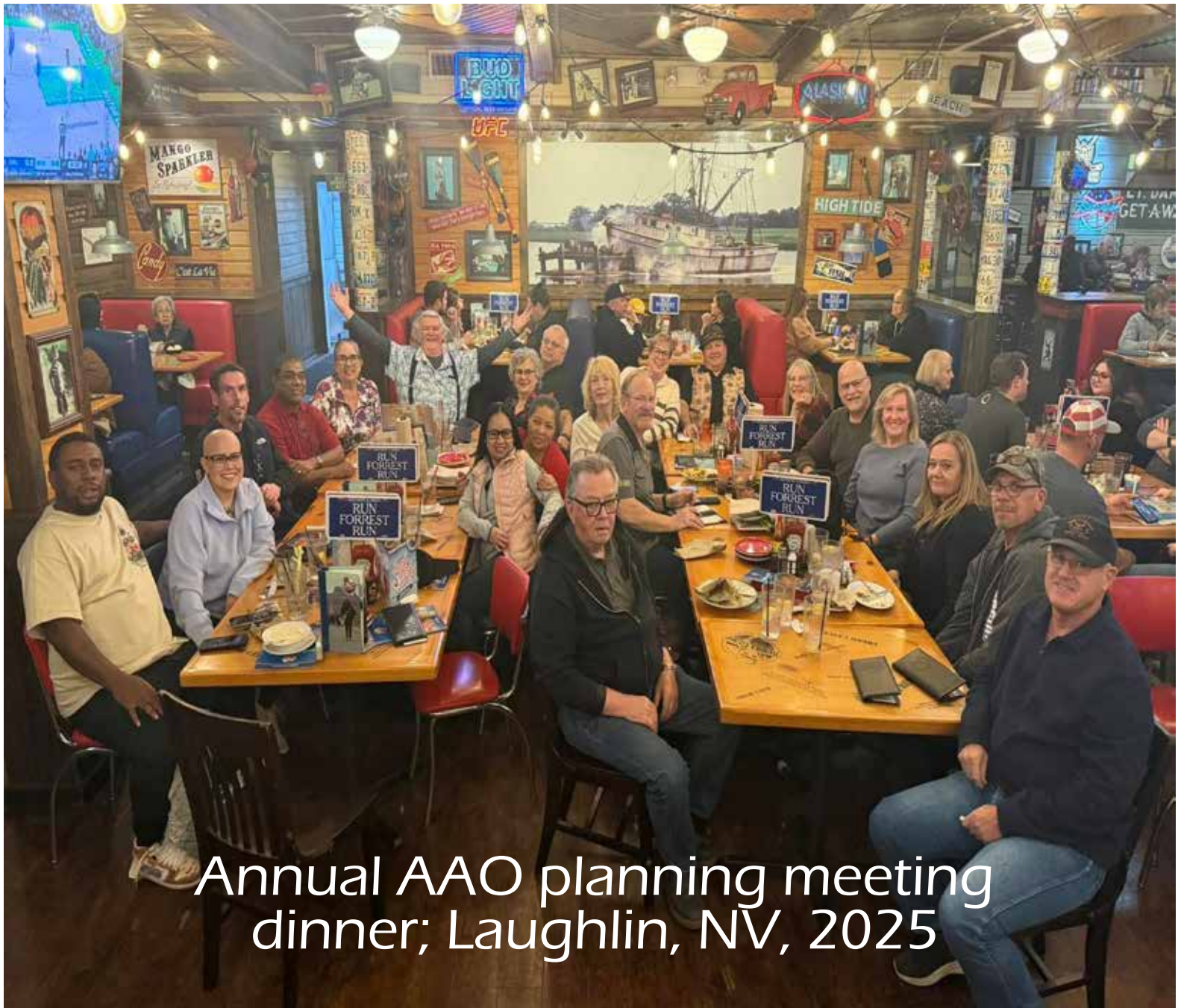
Annual AAO planning meeting dinner; Laughlin, NV, 2025

Annual Chapter Financial Reports are due at the General Business Meeting in Reno. Chapters should submit their annual financial report to the National Treasurer after the end of May 2025 and before 18 Jul 2025